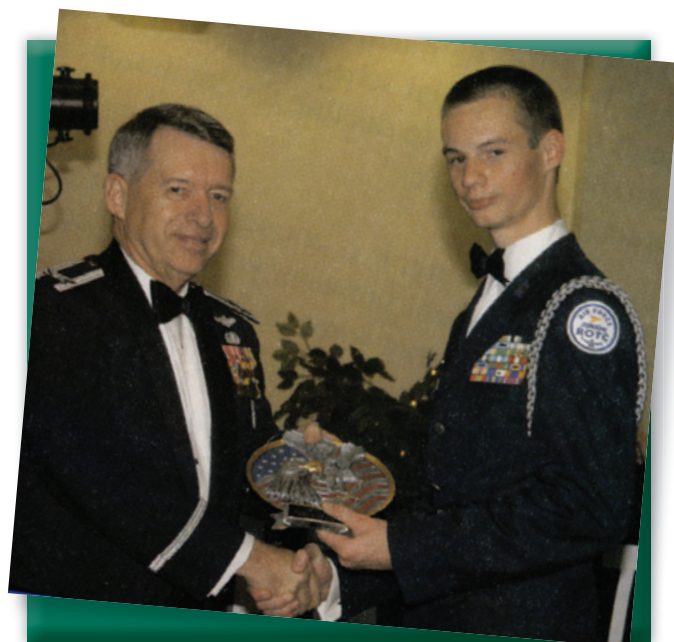
A cadet in semi-formal dress uniform receives an award at a Military Ball.