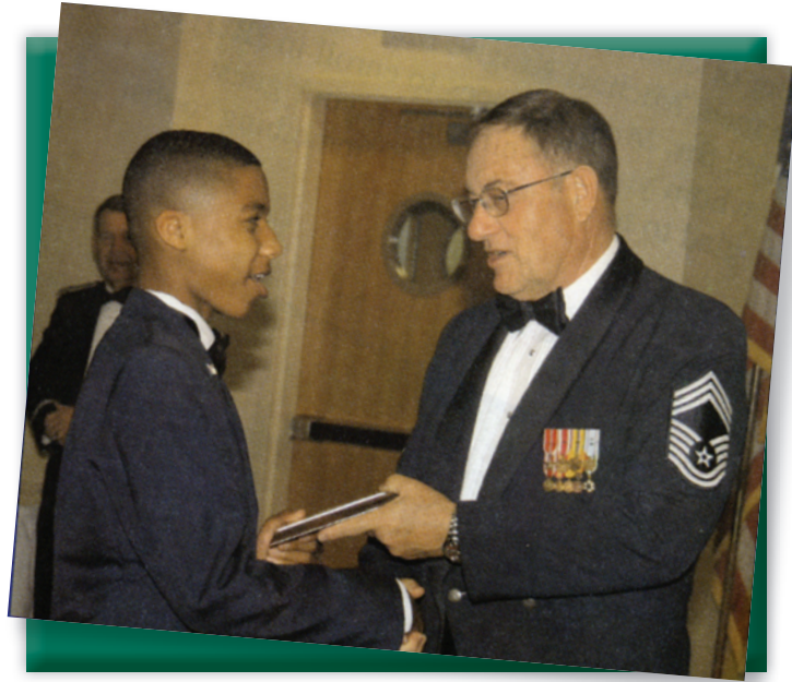
A JROTC cadet shakes hands at a Military Ball.

When being introduced to a lady outside, a gentleman in civilian clothes should remove his hat. If in uniform, do not remove your hat. In addition, a gentleman will ordinarily remove his glove to shake hands unless he is a member of a Color or Honor Guard. If a gentleman is confronted with a sudden introduction when he has gloves on and it is awkward to remove a glove while the other person has his or her hand outstretched, it is better to shake hands with the glove on with no apology. These are good rules to follow as part of general public behavior, even in casual situations.