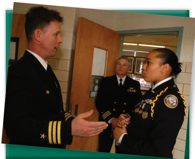
Personal introductions should be simple and direct.

If seated, you should rise to acknowledge an introduction and remain standing while other members of the party are being introduced to one another. When being introduced to ladies or gentlemen who are seated, you need not rise if rising may inconvenience others at the table.