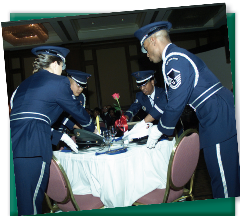
POW-MIA Honor Guard.

The POW-MIA Ceremony is generally used in conjunction with the opening of a dinner function. Although no one is sure where this ceremony began, it is believed to have been started by naval crewmembers known as the Vietnam River Rats. The River Rats were US Navy service members who patrolled the deltas and rivers in small patrol boats during the Vietnam War. This solemn remembrance is for the men and women in all five services—Air Force, Army, Navy, Marines, and Coast Guard—who were prisoners of war and those who are missing in action. There are many different versions of the ceremony.