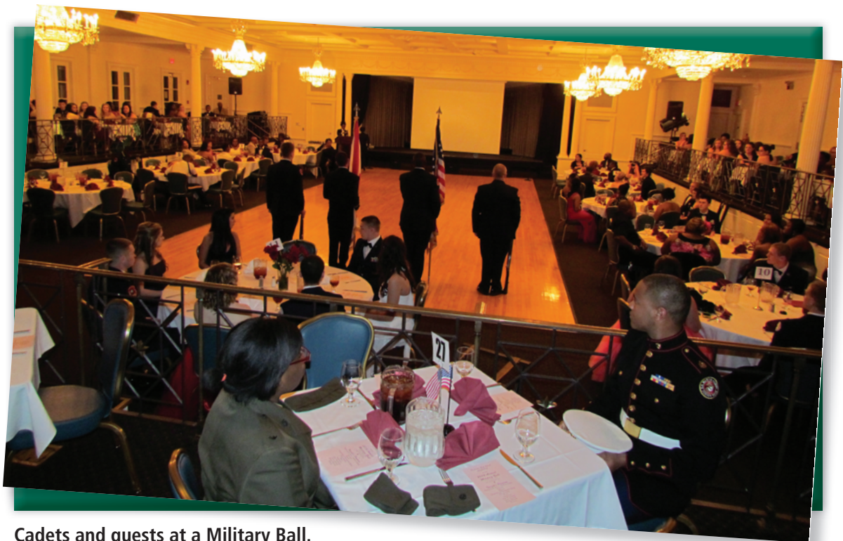
Cadets and guests at a Military Ball.

Another widespread custom in Air Force JROTC is the Military Ball. This formal event requires cadets to wear formal or semiformal service dress and guests to wear formal attire. The Military Ball presents certain rules, procedures, and protocol to be observed. For example, you must wear the uniform the JROTC instructors prescribe, and your date should also be dressed in appropriate attire. An important element of a Military Ball is the receiving line, which is made up of the official hosts and hostesses. You learned about the receiving line earlier in this lesson.