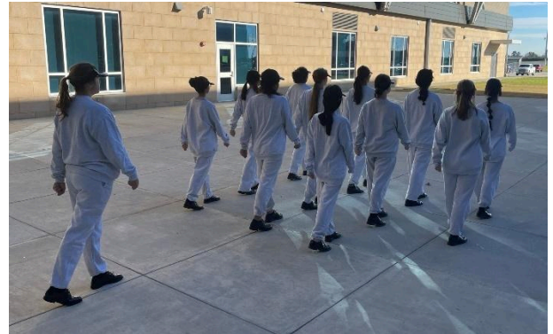
FC position for “ Right Flank, March. ”