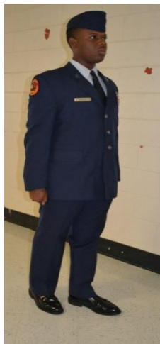
Image shows ball of right foot alongside the heel of the left foot and arms suspended to the side

Teaching technique. Have cadets think “step-pause-step”. They step with the left, there is a very slight pause when bringing in the right foot next the left heel to transfer the weight and then step with the left foot. Emphasize there is no skipping, hopping, jumping, or scraping of shoes on the ground when performing this movement.