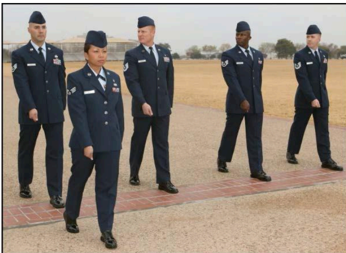
Image shows outside element (guide in front) with head and eyes forward and inside elements with head and eyes turned 45-degrees to the right