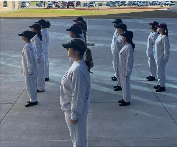
FC starting position for “ Forward, March. ”

As you look at our 30-Step Drill Sequence video, you will see the FC on the outside of the flight all throughout the 30-step sequence. This is correct, but there is also another correct way with the FC coming to inside on the first “ Column Right, March. ” The FC will maintain their relative position on the flight as the flight fell in, 3-paces, centered off the flight.