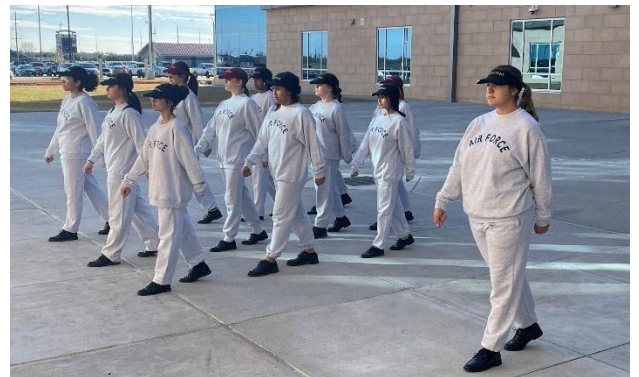
FC position for “ Left Flank, March. ”